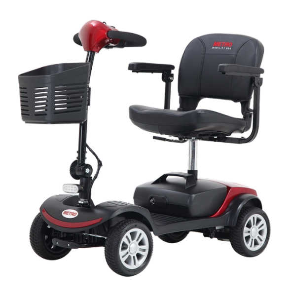
M1 User Manual